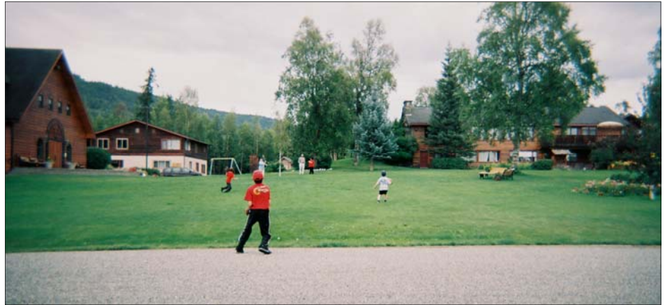
Baseball on the lawn at Saint James House

Not knowing exactly what I wanted to do next, I traveled to Honduras for six