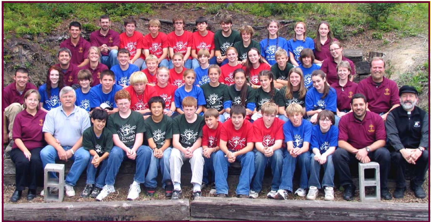
Saint John Summer Camp 2005