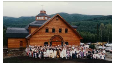
July 21, 1985